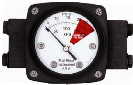
Model 140 0-30 PSID & 0-200 kPa with 2-1/2" Dial & Special Color Dial