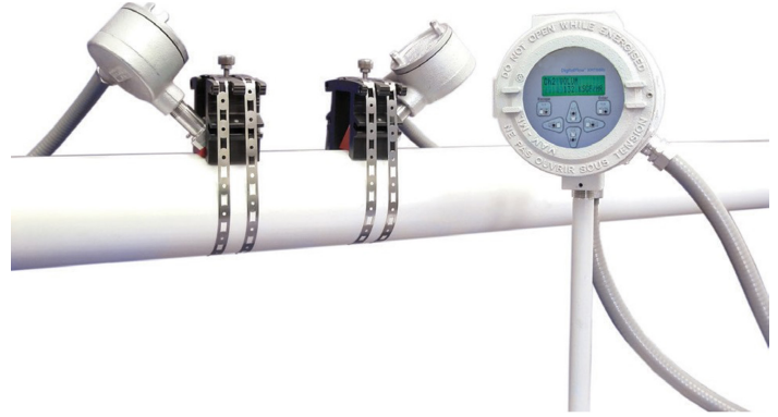
DigitalFlow XMT868i shown with clamp-on transducers

To minimize the effects of flow profile distortions, flow swirl and cross flow, and for maximum accuracy, you can install the two sets of transducers on the same pipe.