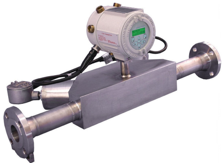
RH-Plus MR2350 dimensions

The DigitalFlow XMT868i can be used with a variety of wetted solutions including the PanaFlow™ system. The PanaFlow meter system relies on the XMT868i as an integral component to simplify installation. A DigitalFlow XMT868i is easily mounted to the top of a PanaFlow system and is shipped ready to install.