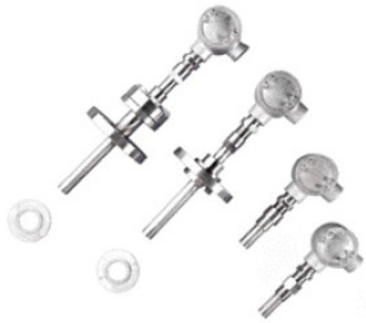
Bundle Waveguide Technology System

Even though most ultrasonic manufacturers' flowmeters can only handle up to 500°F (260°C), Panametrics BWT systems have been able to reach up to 1000°F (537°C). The unique design removes the piezoelectric element from the extreme temperatures by using wave guide technology. The transducer can even be swapped out under operating conditions. One customer has installed 16 units, replacing their wedge meters, and has had them operating maintenance free for more than five years.